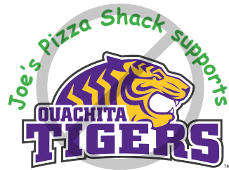
DO NOT combine logo with other text